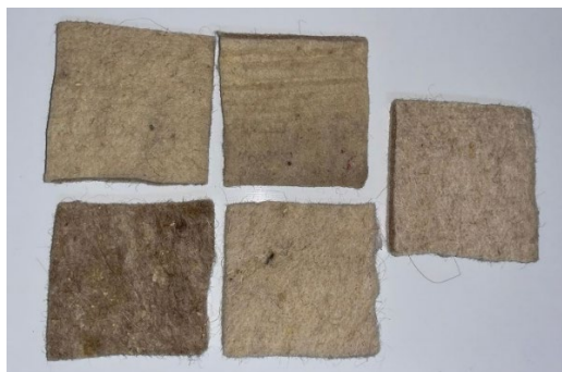
Fig. 1. Samples of nonwoven materials

Materials and methods. Six samples of sheep wool nonwoven fabric obtained by needle-punching were analysed (Fig. 1.). The samples differed in the number of layers, thickness and density. The materials were obtained from 100% coarse and semi-coarse wool of fat-tailed and “Bayys” (Kazakh fat-tailed semi-woolly breed) sheep breeds, provided by IP “Miras”.