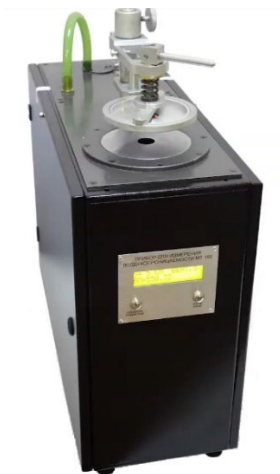
Fig. 2. Air permeability tester MT 160

Air permeability was carried out in accordance with GOST ISO 9237-2013 “Textile materials. Method for determination of air permeability”. The tests were carried out using the Air Permeability Tester MT 160 by “Metrotex” (Fig. 2).